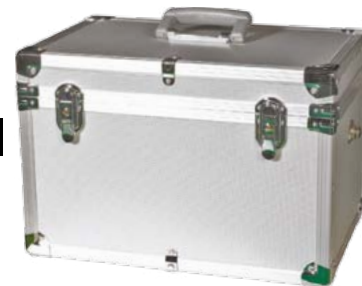
Aluminium Carrying Case