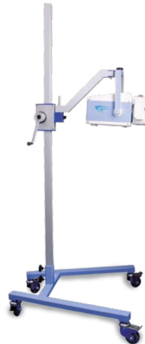
PXMS - 1800 Mobile Stand