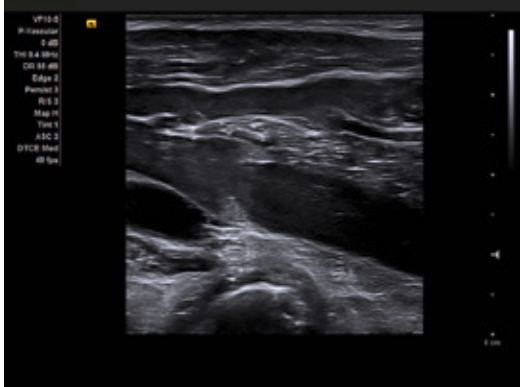
Left: Color Doppler of renal vasculature.